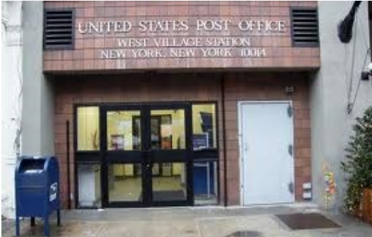
a post office.

Role Play. Get to know places a tourist visiting your city ask about. Take turns on asking and giving directions. Use the map given below.