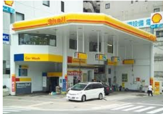
a gas station.