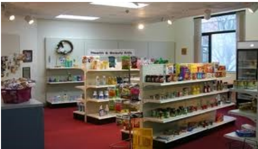
a convenience store