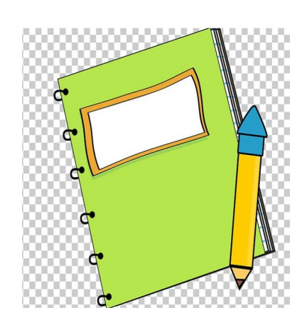
Activity 1. Identify the pictures.

Whom will you meet on your first day in your new school? What will you bring on your day in school?