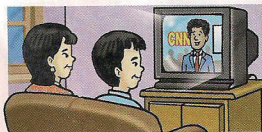
4. your parents watching the news