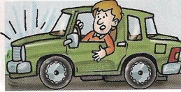
5. your car making strange noises