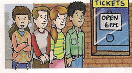
8. you and your friends standing in line for concert tickets