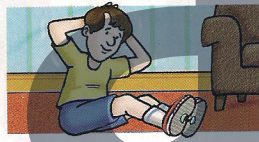
2. Gary exercising