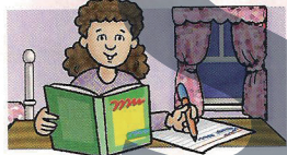
1. you studying