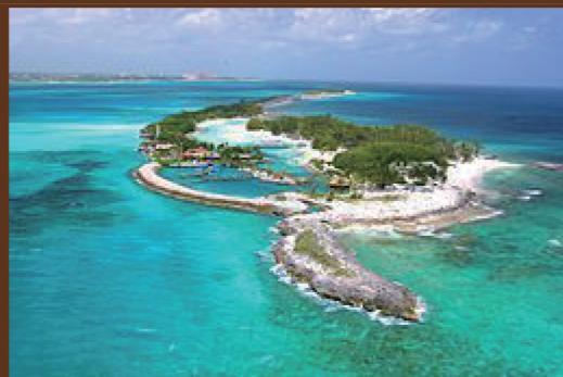
Blue Lagoon Island

The Atlantis Paradise Island is a resort and waterpark located on Paradise Island , the Bahamas.